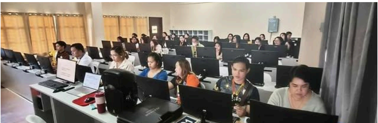
MU-OLE Training for faculty

Misamis University advances its commitment to quality, accessible, and technology-enhanced education through the development of the Misamis University Online Learning Environment (MUOLE), a supplemental digital platform initially created by the College of Computer Studies (CCS) to support laboratory-based courses and later expanded for university-wide use. Anchored on the institution's philosophy, vision, mission, and objectives—along with its priority on academic innovation and learning continuity—the MUOLE system enables students across all colleges to access learning materials anytime, submit outputs online, receive timely feedback, and continue academic engagement during class suspensions caused by natural disasters or emergencies. By providing a stable, Moodle-based digital environment hosted on the university's secure server, MU strengthens instructional delivery, enhances digital literacy, and contributes to SDG 4 (Quality Education) through inclusive, flexible, and resilient learning opportunities for both faculty and students.